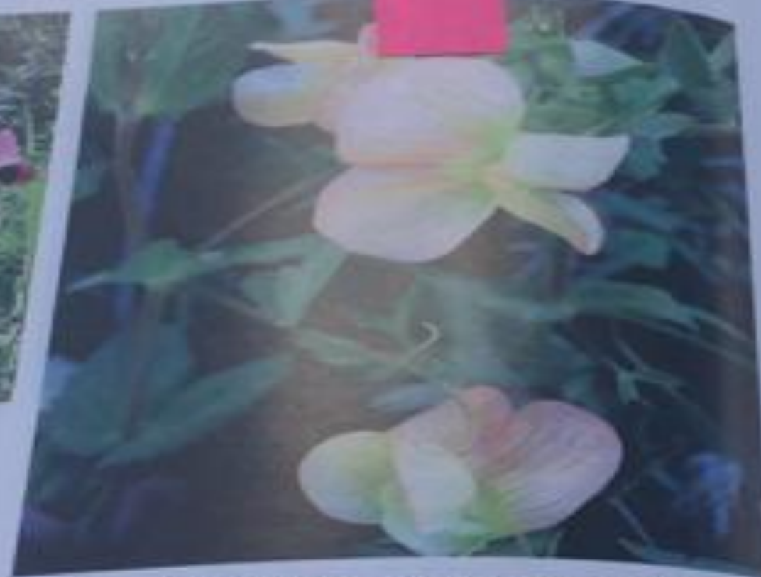
▲ Pisum fulvum Sibth. & Smith. Rayfoun, Aayta- roun, Khardali, Sarada. Grass land, common. EMR. Tawny pea. POIS FAUVE. بيسة برية. Creeping glabrous plant 20-60 cm; 1-2 pairs of oval leaflets; fulvous yellow flower with bi-lobed stan- dard; reticulate, short pod. Fl: 3-5.