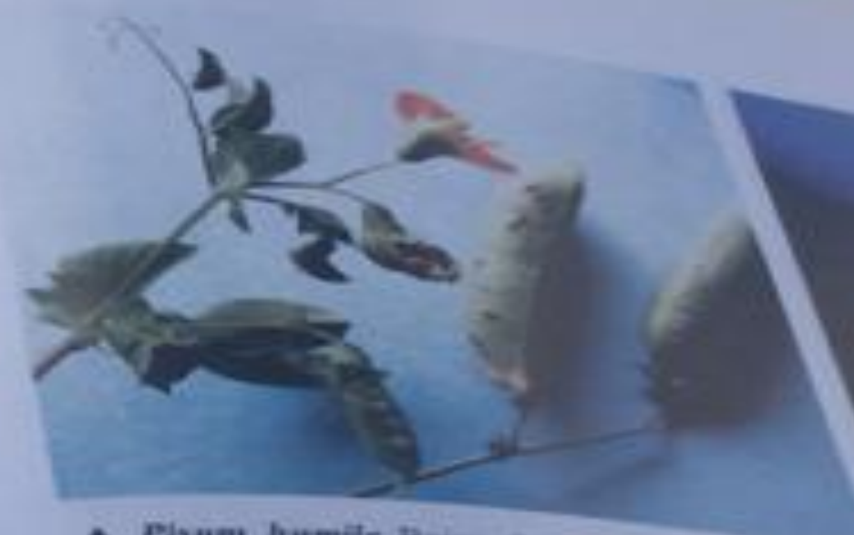
▲ Pisum humile Boiss. & Not Seemine. Aayya. Fields. EMR. Low pea. POIS HUMBLE. بيسة غالية. Climbing plant 30-60 cm; 2-3 pairs of ovate leaflets; tern lilaceous keel with pale purple wings; reticulate pod; green marbled globulose seeds. Fl: 3-4.