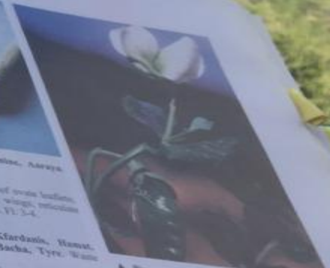
▼ Psoralea bituminosa L. Kfardanis, Hamat, Chabrouh, Baskinta, Jhr et-Bacha, Tyre. Waste ground. Bitumen pea. HERBE AU BITUME. حومل جيري. Spreading or erect plant 30-100 cm; leaflets with vari- ous form, median is very petiolate; blue-violet flower 15-25 mm with hirsute calyx; oval hispid pod with long beak. Fl: 4-7. M.