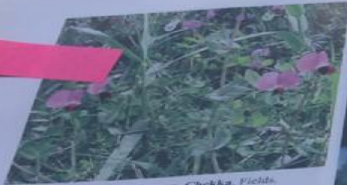
▲ Pisum arvense L. Masnaa, Chekka. Fields. Field pea. POIS DES CHAMPS. بيسة الحقل. Creeping plant 1 m long; 2-3 pairs of ovate leaflets; bluish big flower has purple wings; reticulate pod; smooth angular seeds. Fl: 3-4.