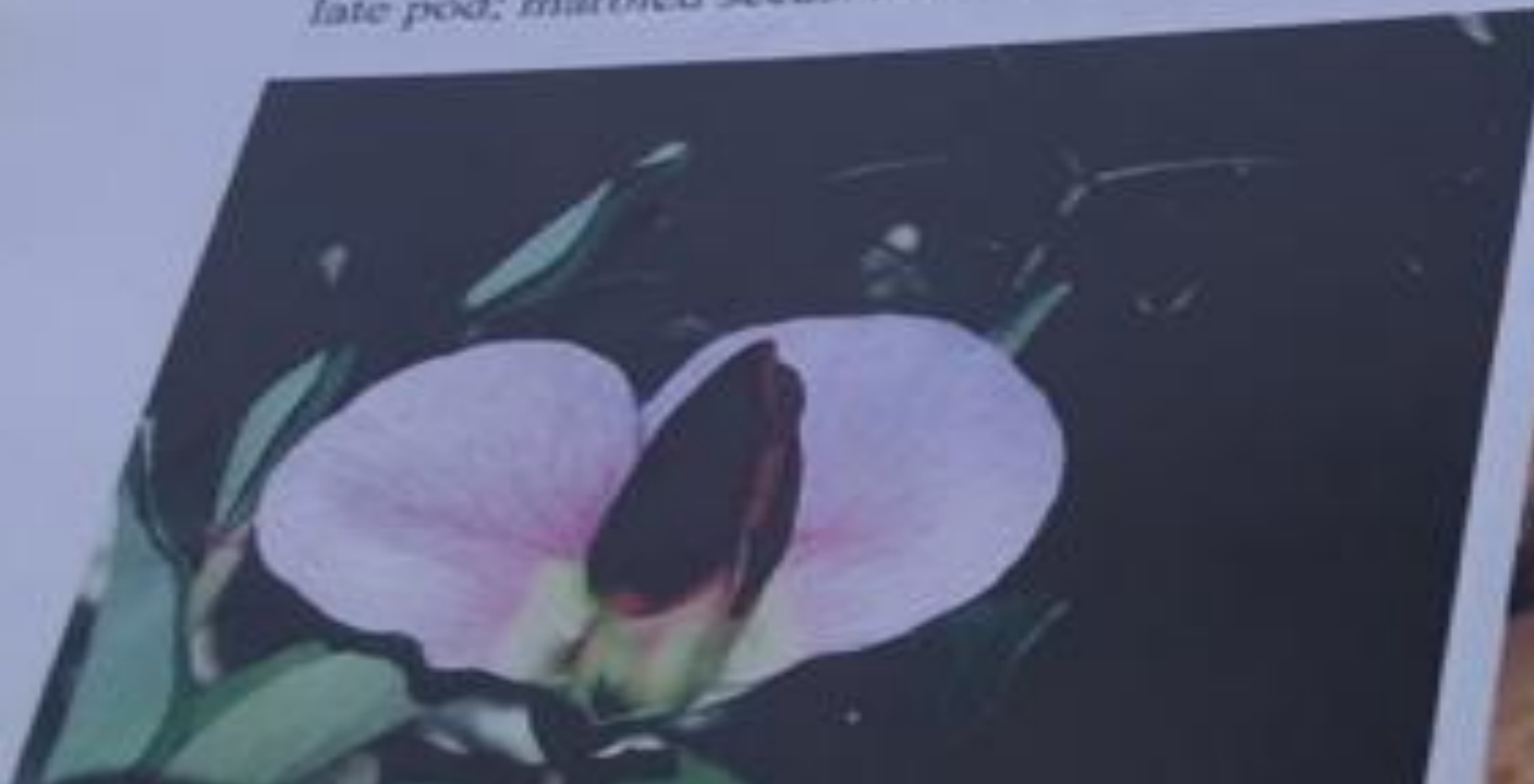
▼ Pisum elatius Bieb. > Ras Bayada. Fields. Purple pea. POIS ELEVE. بيسة عالية. Creeping plant 2 m long; 1-3 pairs of ovate leaflets; reddish standard with purple wings; pale keel, reticu- late pod; marbled seeds. Fl: 3-4.